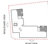
KEY PLAN - C3