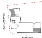
KEY PLAN - C3