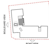
KEY PLAN - C3